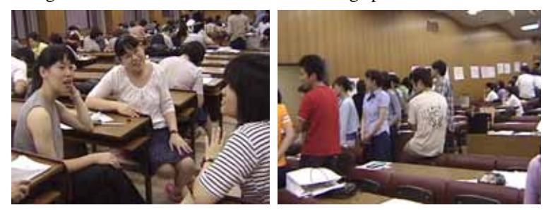
Figure 1b Group discussion and the first poster session in the first trial