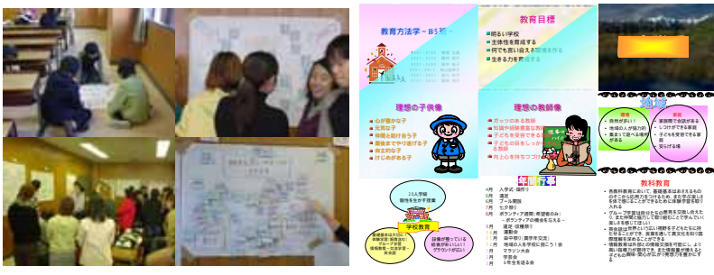
Figure 3 Team working and the first outcome in the third trial